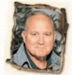
General H. Norman Schwarzkopf