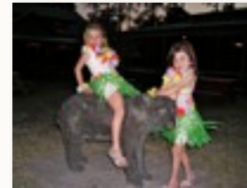
Saturday night luau... the big dance...

The camp has served more than 44,000 campers and their family members since opening in 1996 at no cost to them or their families. The estimated cost per camper is $2,877. The camp invites children ages 7 to 16 with the following illnesses or diseases: asthma, bleeding disorders, cancer, craniofacial disorders, diabetes, epilepsy, heart/ cardiovascular, HIV/Aids, inflammatory bowel disease, kidney disease, rheumatic disease, ventilator assisted disorders, sickle cell anemia, spina bifida, and transplants.