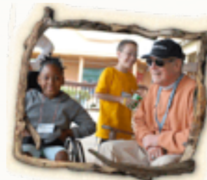
The late Paul Newman at Camp Boggy Creek

Actor and philanthropist Paul Newman dreamed of opening a camp for children with serious medical conditions. His dream became a reality in the fall of 1988 when he founded The Hole in the Wall Gang Camp in northeastern Connecticut. This wondrous place became the starting point for what is now a global family of camps which includes Camp Boggy Creek, Florida’s camp. Tampa’s General Norman Schwarzkopf is one of the founders of Boggy Creek.