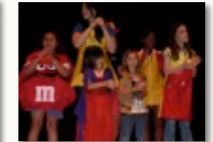
The big show on Sunday morning at the theatre...